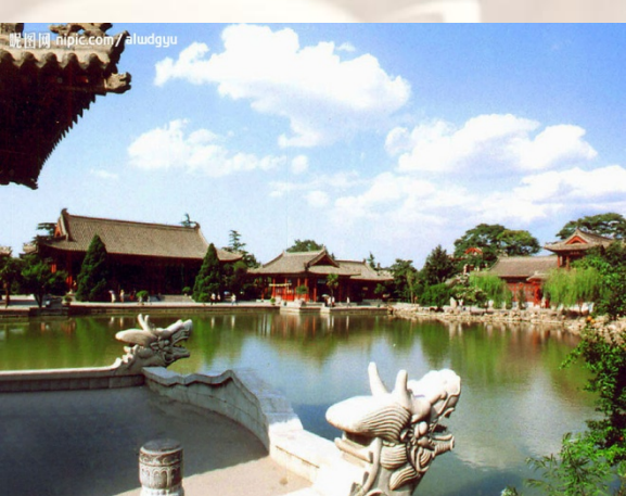
Huaqing Hot Springs